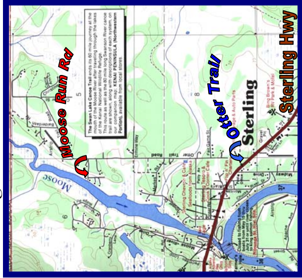
Map by Todd Communications 1997

Milepost 81.5 on the Sterling Hwy, (in downtown Sterling Alaska, directly across highway from Gloria's Hair Salon), take "Otter Trail" 1.3 miles, turn left on "Moose Run Road" 0.2 Miles. (See arrows on map for where to turn and follow signs).